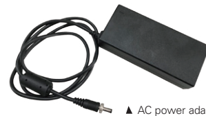
▲ AC power adapter (for MPC102-845-J)