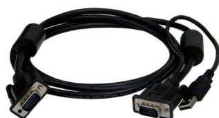
USB KVM Cable