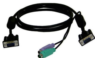
PS2 KVM Cable